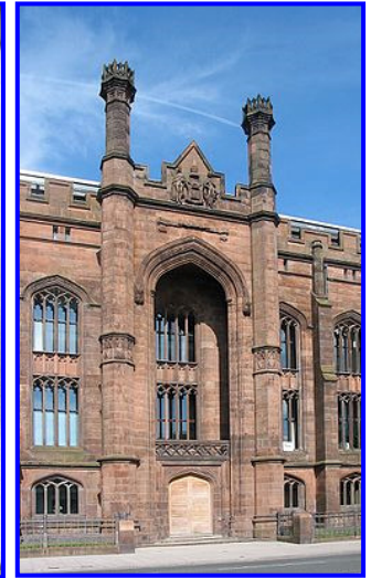
Liverpool Collegiate College

He may be said in this respect to have fallen at the moment of victory, for he died on the morrow of the day when the school was first opened for the reception of pupils.