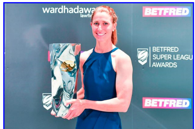
Hill was named Woman of Steel in Salford on Sunday night