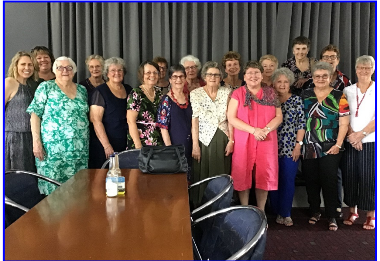
Group Photo - Sarina RSL