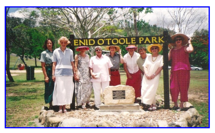
Editor's Note: The following article was sourced from the Rockhampton City Council's website.