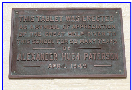
Memorial plaque for A H Paterson - now located in the foyer outside the Principal's office. However, the Henry IV inscription seems to have disappeared.

Editor's Note 4: It is believed that at some time in the 1980s, the gates with the metal scroll across the top were replaced due to the deteriorated condition of the original gates.