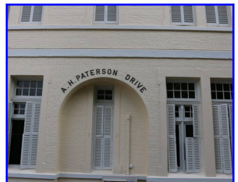
Photo of the inscription A.H. Paterson Drive across the window arch