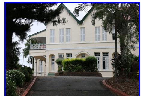
Photo of Paterson Drive showing the drive up to Paterson House