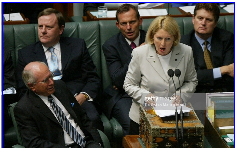
John Howard and De-Anne Kelly in question time in Parliament House Canberra.