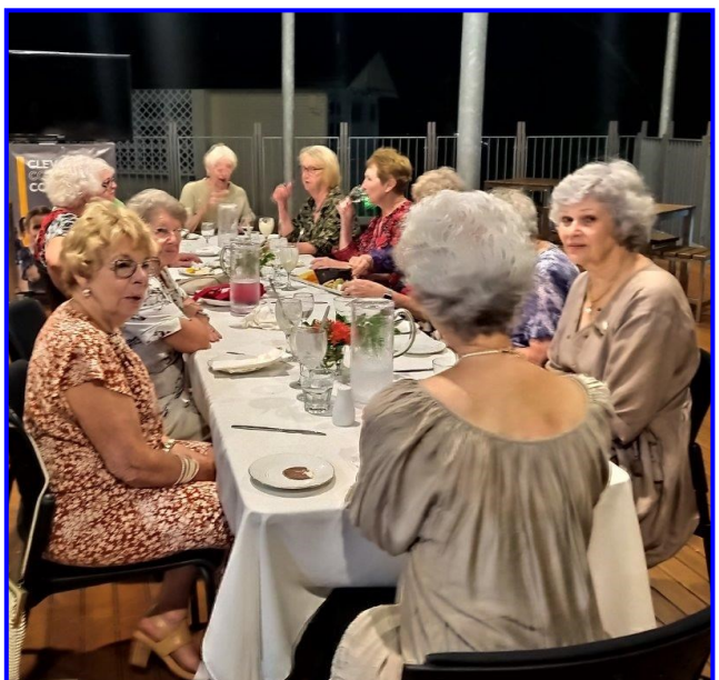
Group photo - Dinner on the Deck